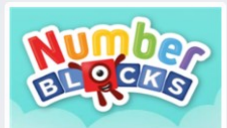
BBC Number Blocks!

Interactive resources offers a wide range of maths games. Username: Brookfield Password: ilovemaths